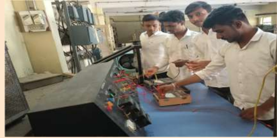
ELECTRICAL MACHINE LAB