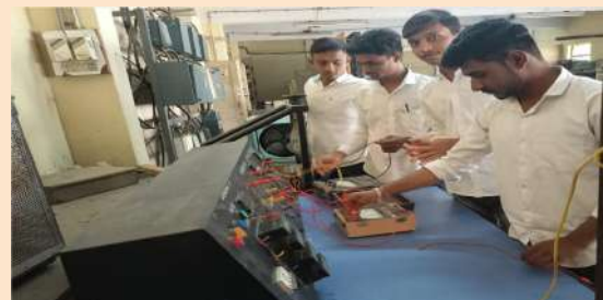
ELECTRICAL WORKSHOP AND PROJECT LAB