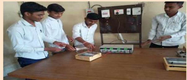
BASIC ELECTRICAL AND MEASUREMENT LAB