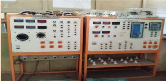
SWITCHGEAR AND PROTECTION LAB