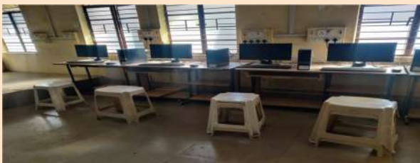
COMPUTER AND NETWORK LAB